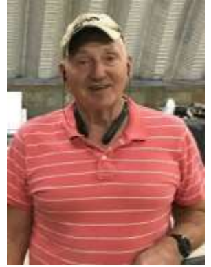
1-30-21 RUT Champ