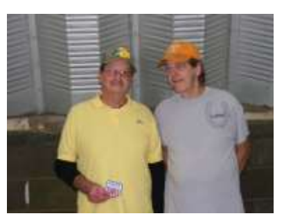
2-11-17 MG CLA 1<sup>st</sup> Cooper 3<sup>rd</sup> Osborne 2<sup>nd</sup> JoAnn Stanford(not pictured)