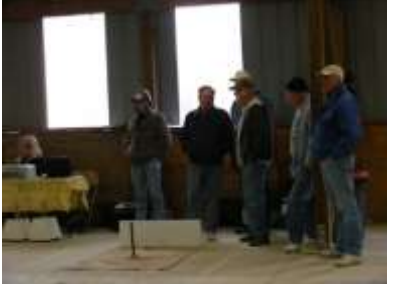
2-11-17 Crossville awaiting results

WINTER PRACTICES: Morgan's Courts on Thursday 10:00 am. Non sanctioned Crossville Courts Tuesdays at 2:00 p.m. non sanctioned Crossville courts Thursdays at noon sanctioned –must have a card Heaters will be used at both courts when necessary!