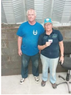
12-01-18 MG CLA 1 st Stanford 2 nd Nease