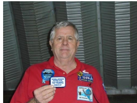
NHPA 10 YEAR Patch!