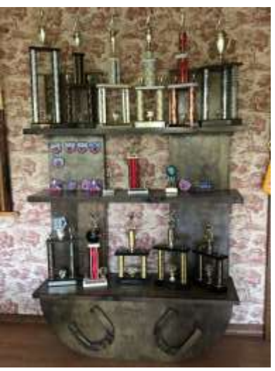
WHERE TO PUT TROPHIES? Tommy Wahl's Looks GREAT!