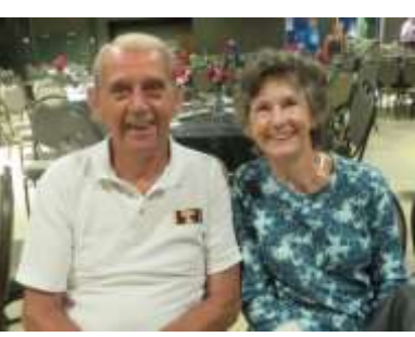
TN STATE Gray & Annabelle GOLD Horseshoes