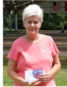
8-24-29 CLK CLA champ