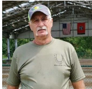
8-24-19 CLK CLC 1 st