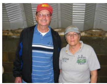
3-4-17 MG CL A 1<sup>st</sup> Stanford 2<sup>nd</sup> Cooper