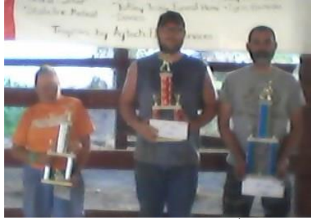
2018 KY Watermelon Festival 3 rd Place