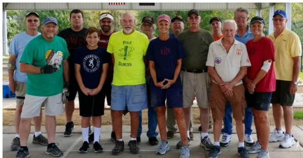
10-6-18 Clarksville Tournament