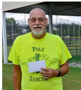
10-6-18 CLK CLC 1st macmillian