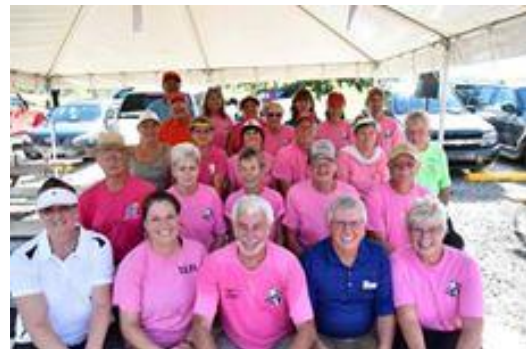
Horseshoe Tour 2018 30 footers Morgan City