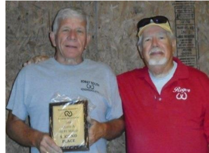
2018 30 FT Mixed 1 st Totten 2 nd Merle South