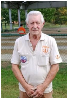
10-6-18 CLK CL E 1 st