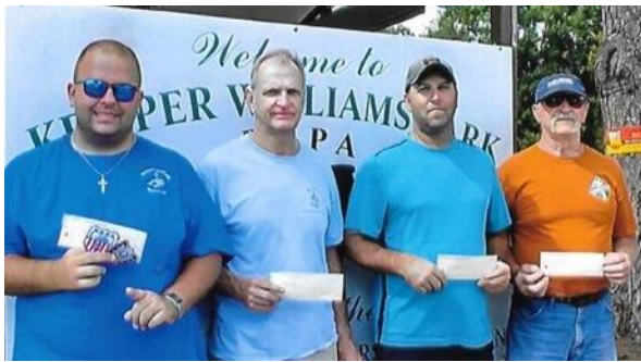
2018 Horseshoe tour Morgan City 40 FT CL F