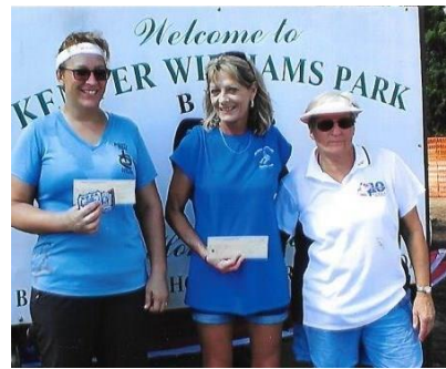
2018 Morgan City 30 FT CL F 3 rd